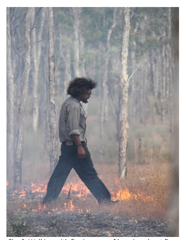
Fig. 6: Walking with fire is a way of learning about fire

There are difficulties in applying traditional fire management in places such as the Blue Mountains and Western Sydney due to the lack of access and control of country by Traditional Custodians and the impacts of fragmentation, land use and other environmental issues. However, I believe cultural burning still has a place in managing the landscape and continuing cultural practices. Ideally, it allows for the empowerment of Aboriginal people to enhance their understanding of themselves and to put fire into the landscape in