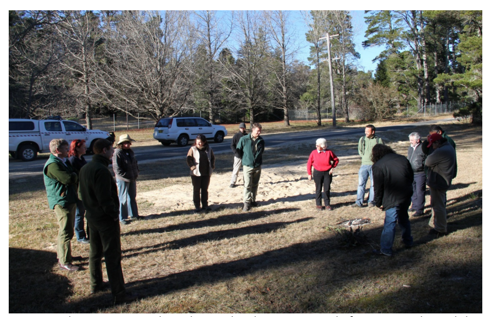
Fig. 8: A smoking ceremony taking place in the Blue Mountains, before a Firesticks workshop.

Figure 8 is a smoking ceremony, showing the importance of coming together, sharing stories and working together and moving forward.