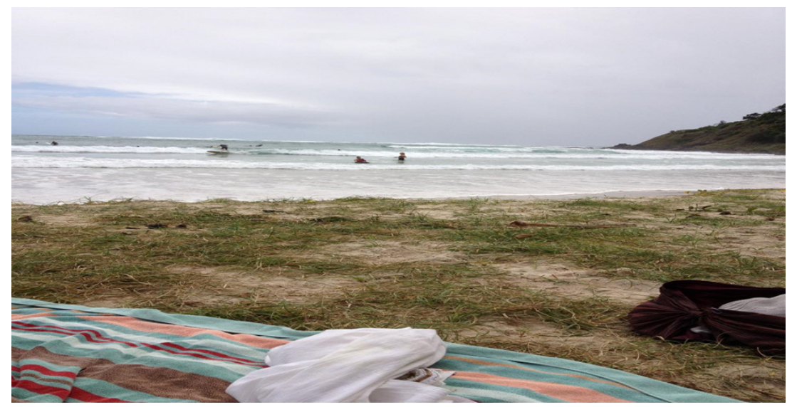
Fig.1: Watagoes Beach, Byron Bay NSW.

and up in the hills, so affinity to all that country is very important to me. It provides a sense of grounding and an opportunity to understand who I am in a way I believe is really important and relevant in a contemporary setting where it does not matter how light or dark-skinned you happen to be, or where you come from. It provides the opportunity to be able to make a connection with Place, which I believe is a vital attribute to being a healthy and happy person. Firesticks has very much been a vehicle that has made it more possible to express myself and be able to connect with other people. It is very important for people on Country.