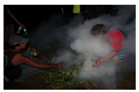
Fig. 4: Fire used for a welcoming and cleansing ceremony – practicing customary law/lore. Cultural fire across the landscape is often used to cleanse country.

Fire is not just in the landscape; culturally fire is used for many reasons. An example of this is a welcome smoking ceremony. Figure 4 shows a ceremony in Cape York.