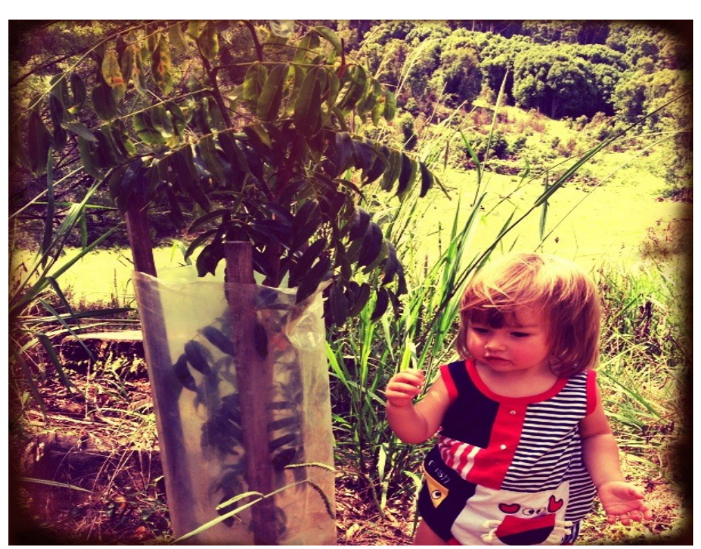
Fig. 7: My daughter next to her black bean tree.

which grows nearby. The black bean tree is culturally significant to me and my people, but to many Bundjalung people, the black bean tree may not be particularly significant. All of the environment, all plants and animals have significance, but some have greater significance because we have stories about them, or we use them for food, medicine or materials. There are many different potential meanings that need to be recognised before the true significance of cultural values can be fully appreciated.