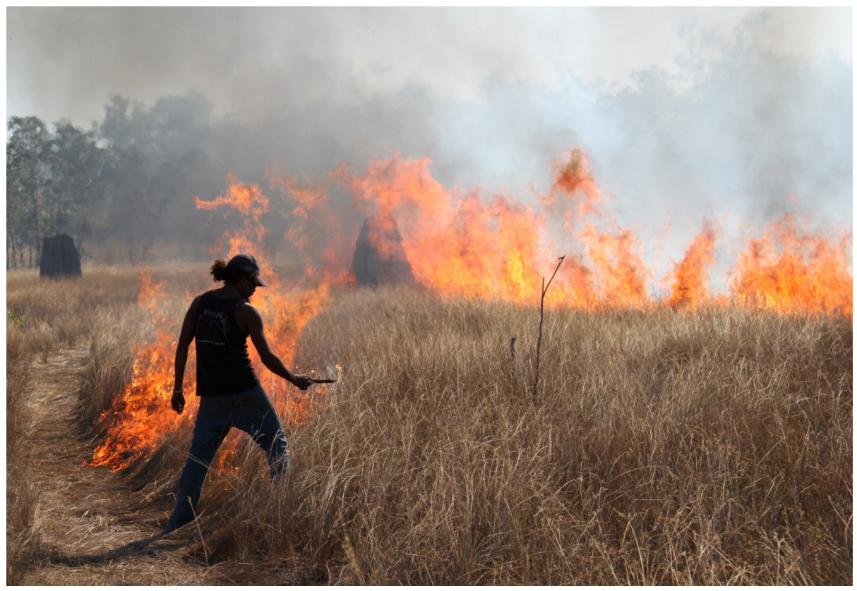
Fig. 5: Reclaiming the land through the sharing of fire stories and the practicing of cultural burning

Walking with fire (Figure 6) symbolises the diversity of fire and how we think about fire in different ways. I am not suggesting that all types of fire can or should be walked through, but it is important to learn to walk with it, understand it and learn from it; its behaviour, intensity and how the plants, animals and people are reacting to it.