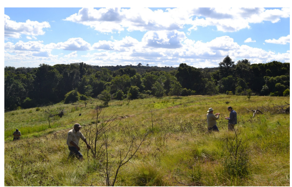
Fig. 9: The cultural pathways in the Grassy Balds, Bunya Mountains.

In the Bunya Mountains in south-east Queensland, the Aboriginal community is reclaiming the grassy balds – hills where grasslands occur on the tops, surrounded by tree and shrub vegetation on the slopes (Figure 9).