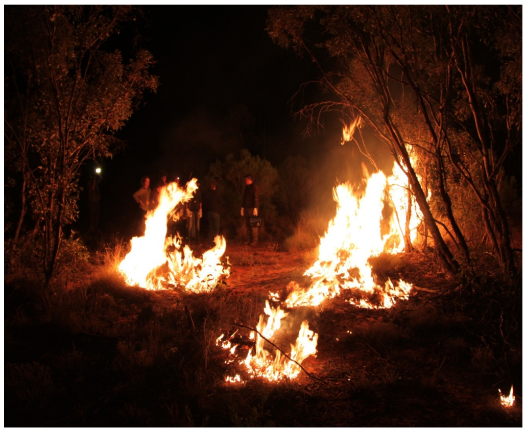
Fig. 10: An important cultural burning activity on Country in the Rick Farley Soil Conservation Reserve, located near the Willandra Lakes - lands of the Ngiyampaa people.

One of the most culturally significant burns I have been on in NSW involved the MAGIC – Mothers Ancestral Guardians Indigenous Corporation, near Lake Mungo in far western NSW at the Rick Farley Soil Conservation Reserve. Many people came together to manage and look after that Country. In this instance, preservation of the Mallee Fowl was one of the important values for the burn proceeding. The image in Figure 10 tells me lots of stories. To me, the fires appear like figures talking together with us - I guess you had to be there.