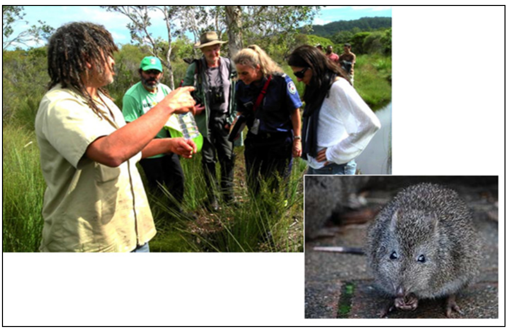
Fig.3: Discussions on cultural and biodiversity values of Ngunya Jargoon IPA recognise knowledge of Country, in this case the importance of fire for this landscape and species such as the vulnerable long-nosed potoroo ( Potorous tridactylus ).

By having this supporting framework, the aim is that people will understand the value of what is being proposed and being undertaken as part of Firesticks, so they can better understand what we see and feel within the project. The idea is to enable us to demonstrate what may be intangible to others with the ecological evidence that is able to be scientifically assessed. This is crucial in being able to demonstrate the value of cultural burning.